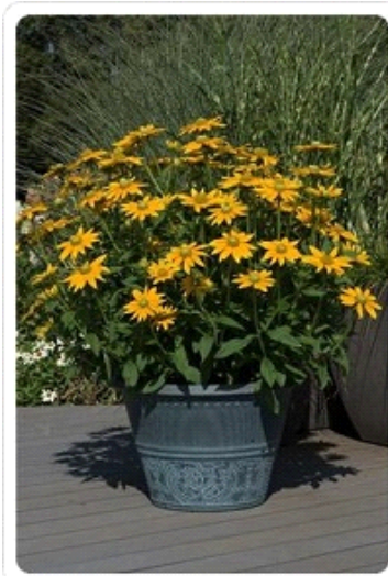
central green eye.

2020 has certainly been the year of Rudbeckia!